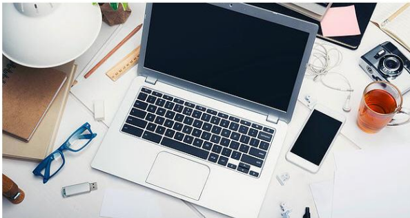
Core Activity 6: Website Development