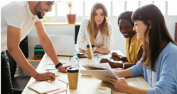
Core Activity 4: Workforce Development