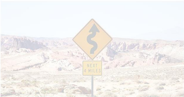
Core Activity 2: Needs and Gaps Assessment