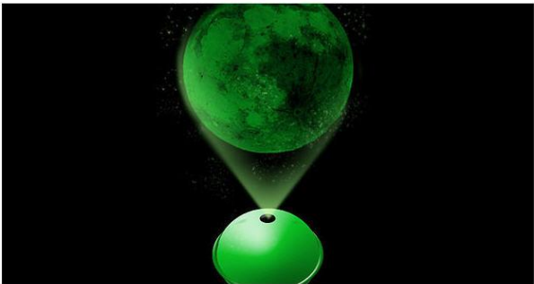
Core Activity 5: Sustainability