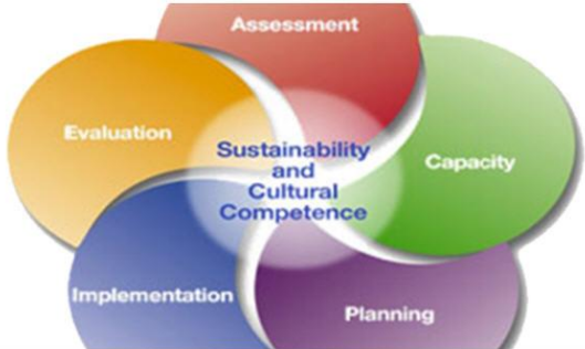
Core Activity 3: Strategic Planning