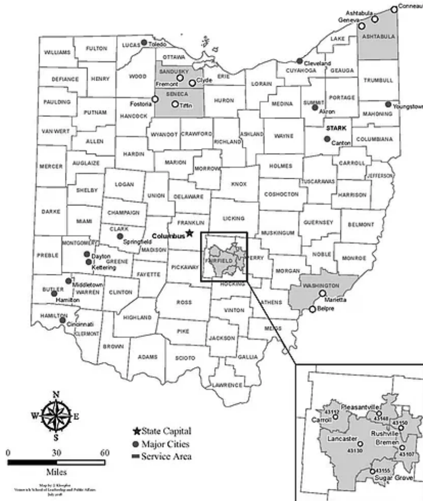
Map of Service Area Served by the Consortium