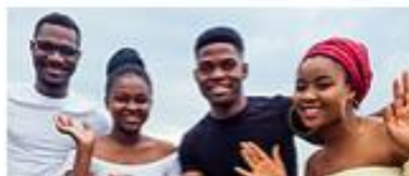
Exploring African American Youth Trauma February 20, 2020 Learn More