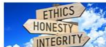
Win-Win Supervision and Ethics December 13, 2019 Learn More