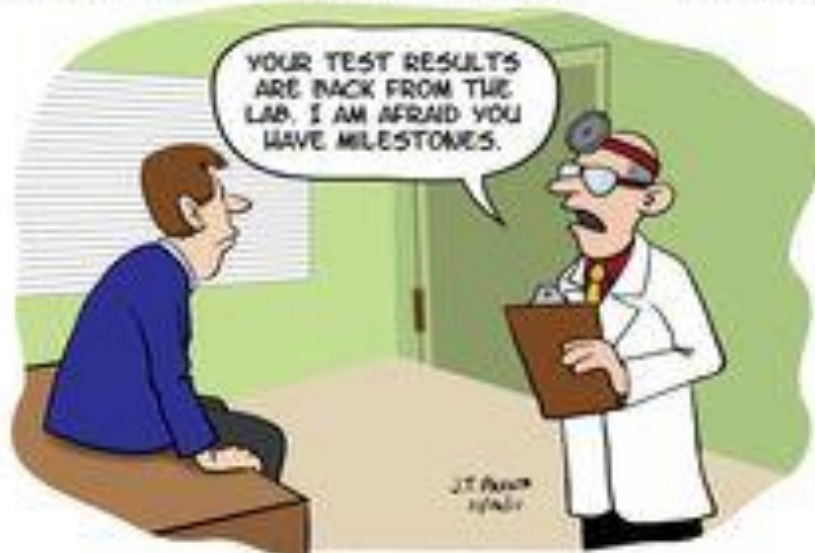
Project Manager Check-Up