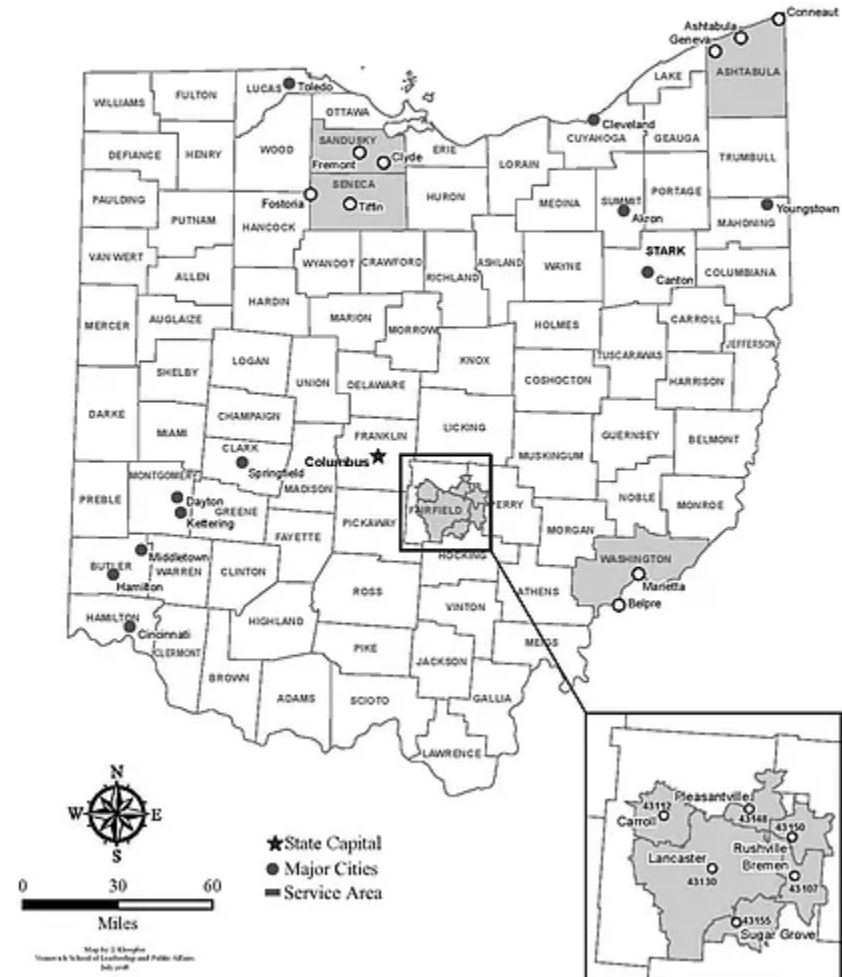
Map of Service Area Served by the Consortium