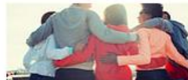
Understanding Recovery Housing and Opioid Use Disorder Multiple Dates Learn More