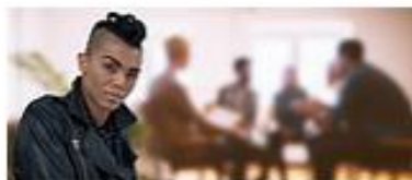
Counseling Transgender December 6, 2019 Learn More